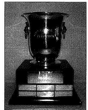
Alan V. Andrews, MD Perpetual Ocean Racing

Hospitality: The Galley (snack bar) will be open from 8:30 a.m. until 4:30 p.m., breakfast is served until 10:30 a.m. Bag lunches may be purchased there each race day. The Wardroom Bar will be open after racing both days.